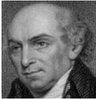
Coastlands William Carey 1792

An “under thirty” young man, William Carey, got into trouble when he began to take the Great Commission seriously. When he had the opportunity to address a group of ministers, he challenged them to give a reason why the Great Commission did not apply to them. They rebuked him, saying, “When God chooses to win